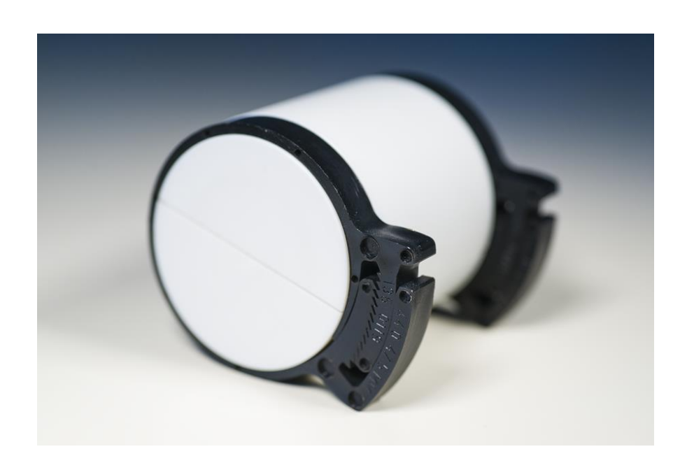
DORIS = DO simeteR for Indoor and outdoor Surveys